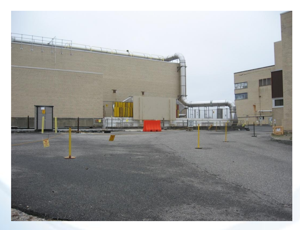
Outdoor Filter Bank